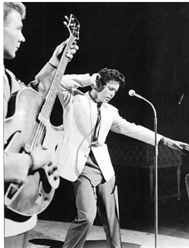
Cliff performing Move It! on his debut TV appearance on Jack Good's TV show 'Oh Boy' on Saturday 13 September 1958.